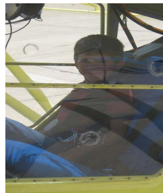
"Hey" where's the pilot?