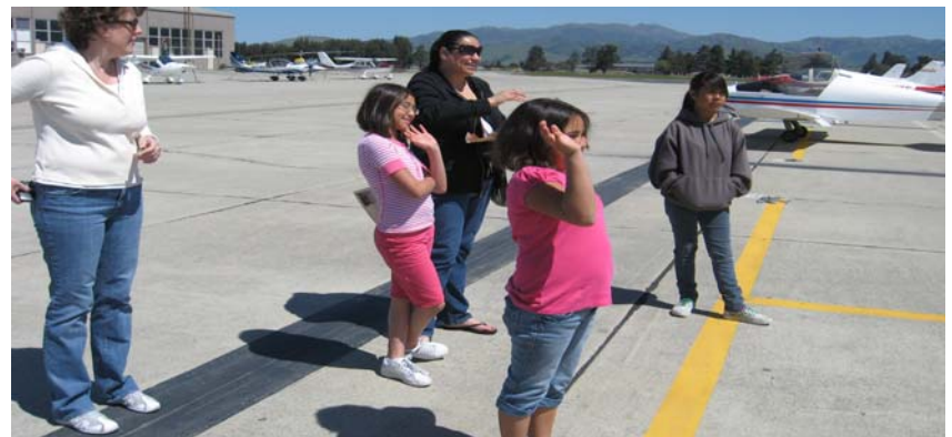
Mom & kids wave good-bye to their brother in Russ's plane.